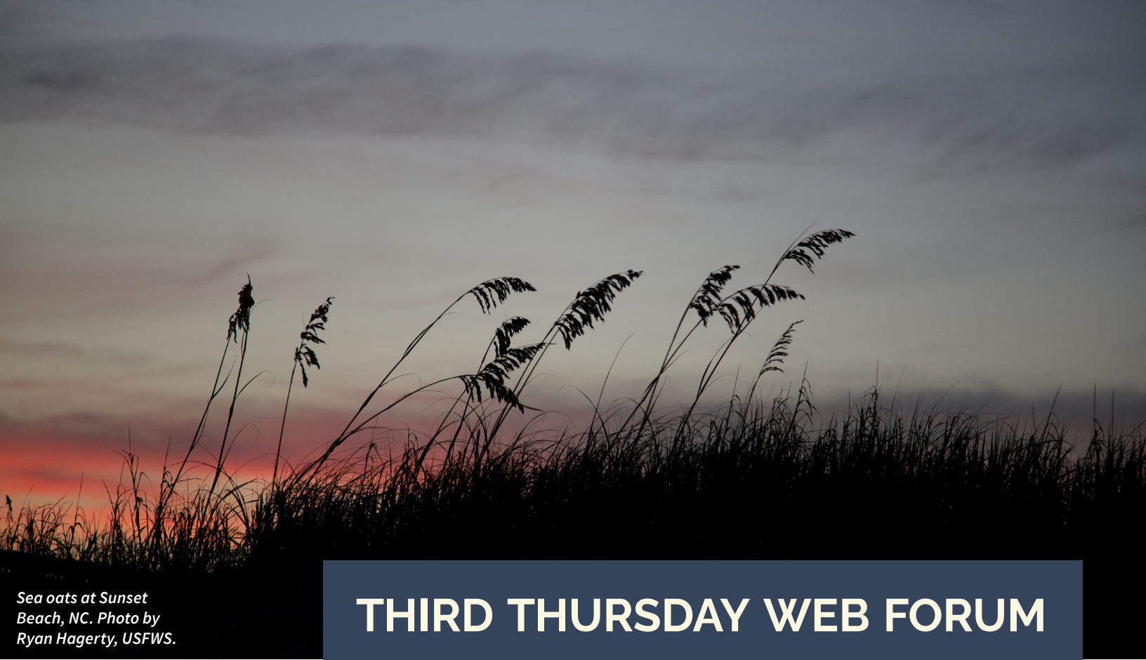
Sea oats at Sunset Beach, NC.