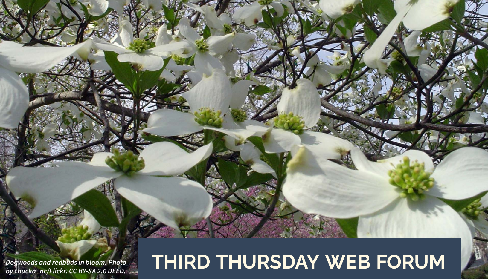
Dogwoods and redbuds in bloom. Photo by chucka_nc/Flickr. CC BY-SA 2.0 DEED.