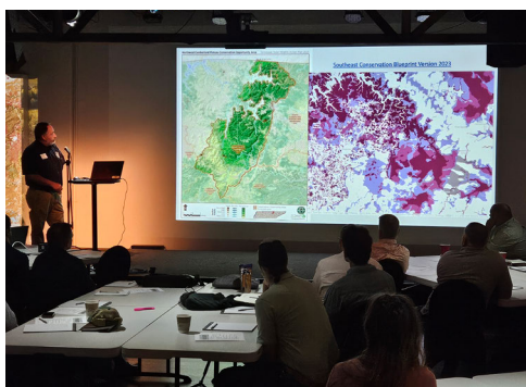
The TN Wildlife Resources Agency explores using the Southeast Blueprint in their 2025 State Wildlife Action Plan.

The Blueprint is helping 480 people from 190+ organizations bring in new funding and inform decisions, including: