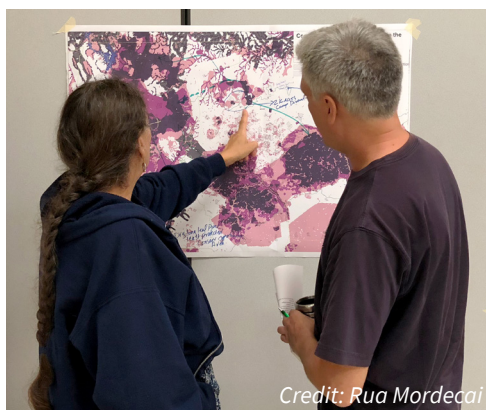
The Blueprint helps identify potential longleaf corridors in North Carolina.