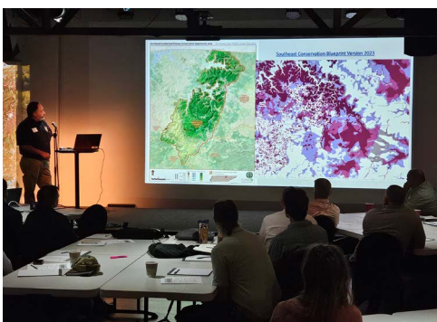
The TN Wildlife Resources Agency explores using the Southeast Blueprint in their 2025 State Wildlife Action Plan.

The Blueprint is helping 450+ people from 180+ organizations bring in new funding and inform decisions, including: