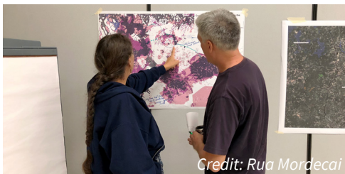
The Blueprint helps identify potential longleaf corridors.