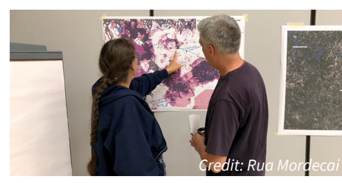
The Blueprint helps identify potential longleaf corridors.